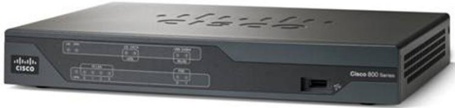
Table 1. Cisco 880VA Series Data Models